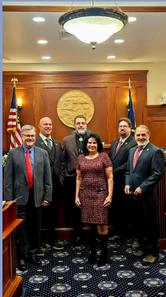
My colleagues in the Senate minority!

As always, my door is always open if you have any questions, concerns, or comments. If you want to set up a meeting, please contact my office at 907-465-4859.